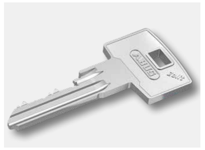
The high-quality, stable key is made from low-wear nickel silver to ensure long-term security.