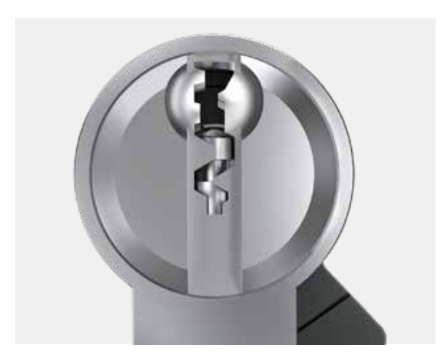
The Zolit conventional locking system with vertical key insertion opens the door conveniently.